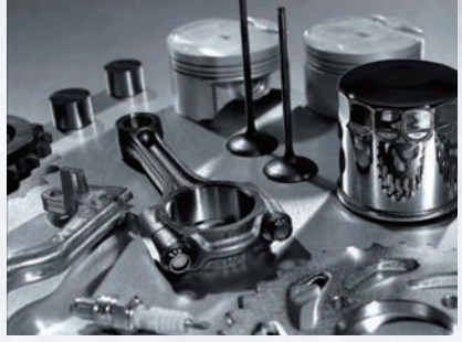
Clean Engine for Longer Life

The innovative lubricating technology achieves thermal stability, which contribute to the ultimate engine protection even when starting engine in cold climates.