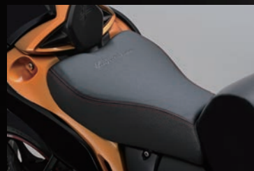
Color seat 45100-10L50-B5P

*Photo shows single seat cowl for unit color of B5L (Black / gold)