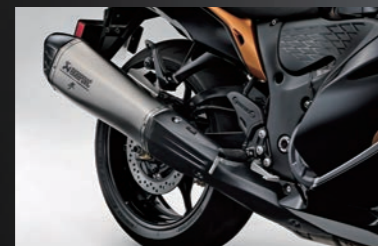
Hayabusa slip-on muffler by Akrapovič 99190-10L00-000

The titanium body muffler with carbon heat shield, which creates pleasant exhaust sound. Around 4 kg lighter and 1.9 kw higher (At 8,400 rpm) compared to the original equipment. The product is developed collaborating with famous manufacturer Akrapovič. Both Hayabusa and Akrapovič logos are printed on muffler body.