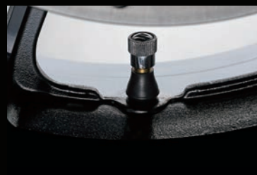
Tire valve cap 99000-19069-000 Tire valve cap with chrome-plated type. *Set of front and rear.