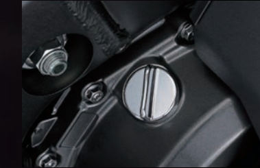
Chrome plated filler cap 09259-20014-000

With heat spot function and 3 levels adjustable heat temperature. (All around of the grip is warmed but it makes you feel warm especially in the fingertips due to appropriate temperature range for each area.)