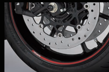
Wheel decal (Cutting type with SUZUKI logo) 99000-WHL02-RD1 Red colored with SUZUKI logo, easy to customize your bike's appearance. *For one wheel.