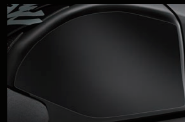
Fuel tank protection sticker 99181-10L00-000 Transparent protection sticker against scratches. *Set of right and left side.