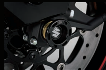
Front axle slider 99115-10L00-000 Front axle slider with S logo. Reduction of impact damage around front axle, unique design, easy to install.