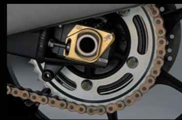
Aluminum chain adjuster 99117-10L00-000 Aluminum chain adjuster with Hayabusa logo. *Set of right and left side.