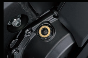
Aluminum oil filler cap 99000-17K36-000 Replacement for the original equipment part which gives your bike a unique look. Made of aluminum.