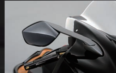
Carbon look mirror cover 99134-10L00-000

Grippy seat surface. Red double stitch, and Hayabusa logo on the surface of seat leads to show you better quality and makes the owner satisfy.