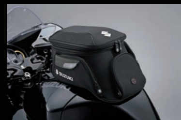
Fuel tank bag (Large) 99000-04600-000 Durable nylon material with reflective piping, volume 11 litres expandable to 15 litres, rain cover and shoulder belt included. *It requires P/N of "99148-00A00-000" for installation. Note) Max load 2.5kg Max speed 130km (Please use the item in the speed of less than 130km.)