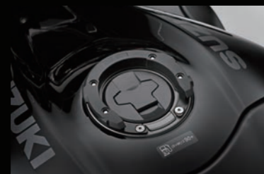
Tank ring for textile tank bag 99148-00A00-000 *Required item to install fuel tank bag large (P/N 99000-04600-000) or fuel tank bag small (P/N 99000-04300-000).