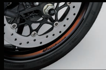
Hayabusa rim decal (Gold) 99182-10L00-GLD Gold colored rim decal with Hayabusa logo. *For one wheel.