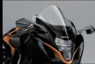
Touring screen 94600-10830-000

Clear type wind screen with better wind protection due to 38 mm higher screen than original one. The shape of the wind screen is carefully designed to consider the whole shape of the bike, and this leads to keep the original image of the bike. Hayabusa logo is put on the sporty graphic of the wind screen which makes you feel ownership of this bike.