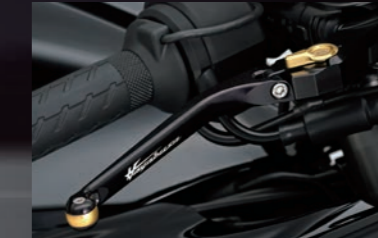
Billet brake lever 99150-10L00-000

Replacement for the original equipment part which gives your bike a unique accent.