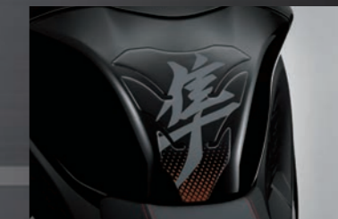
Hayabusa fuel tank pad (Gold) 99180-10L00-GLD

With Hayabusa logo. 4 adjustable and foldable aluminum lever.