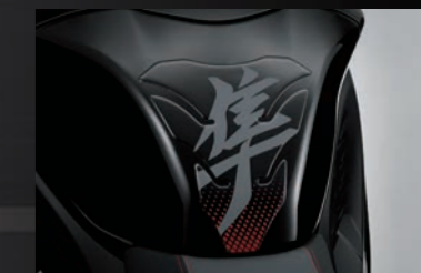
Hayabusa fuel tank pad (Red) 99180-10L00-RED

Gold colored protection sticker against scratches with Hayabusa in Japanese "kanji".