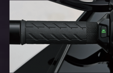
Grip heater 57100-10810-000

With heat spot function and 3 levels adjustable heat temperature. (All around of the grip is warmed but it makes you feel warm especially in the fingertips due to appropriate temperature range for each area.)