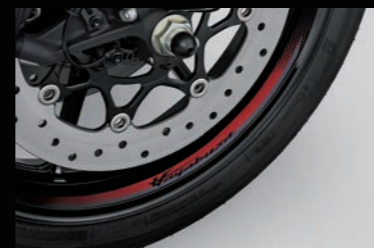
Hayabusa rim decal (Red) 99182-10L00-RED Red colored rim decal with Hayabusa logo. *For one wheel.