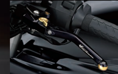
Billet clutch lever 99151-10L00-000

With Hayabusa logo. 5 adjustable and foldable aluminum lever.