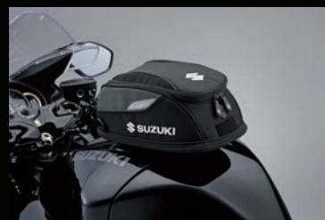
Fuel tank bag (Small) 99000-04300-000 Durable nylon material with reflective piping, volume 5 litres expandable to 9 litres, rain cover and shoulder belt included. *It requires P/N of "99148-00A00-000" for installation. Note) Max load 2.5kg Max speed 130km (Please use the item in the speed of less than 130km.)